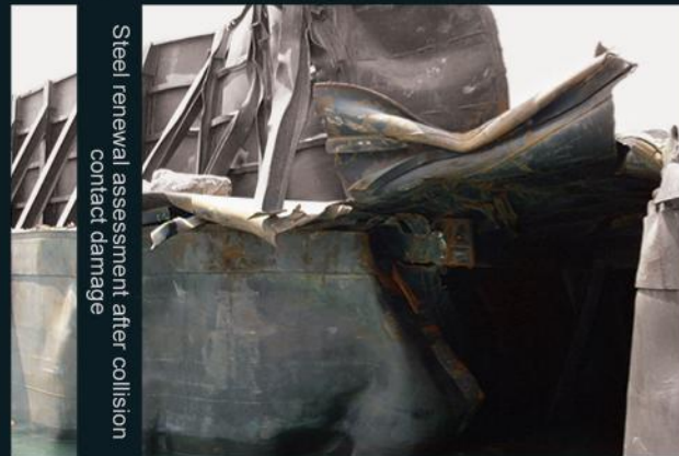
Steel renewal assessment after collision contact damage