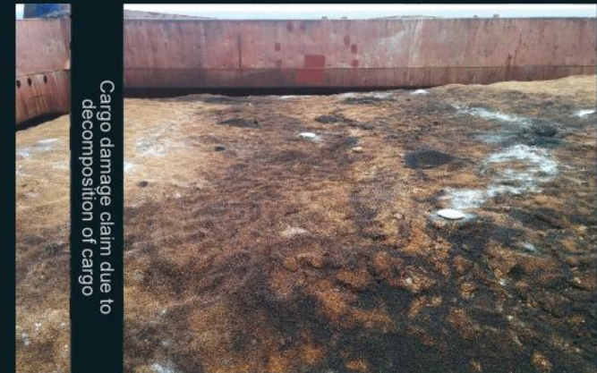
Cargo damage claim due to decomposition of cargo