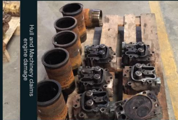
Hull and Machinery claims engine damage