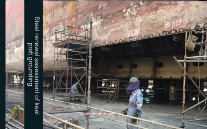
Steel renewal assessment of keel post grounding