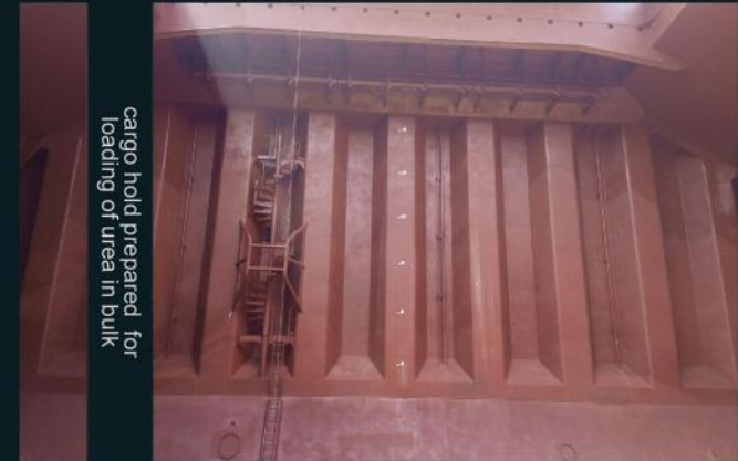
cargo hold prepared for loading of urea in bulk